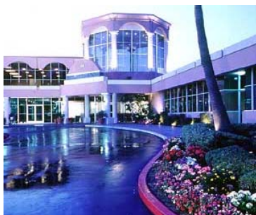
THE HANDLERY HOTEL AND RESORT

On June 12-15, 2003 former crewmen of the USS ENGLAND DLG/CG-22 will meet in San Diego, CA at the Handlery Hotel and Resort for their next reunion. The Handlery is a modern, first-class hotel, located right in the heart of San Diego. It is only minutes away are some of San Diego's most well-known attractions—the San Diego Zoo, Sea World, Old Town, Qualcomm Stadium, Downtown, the Gaslamp District and beautiful beaches. Trolley and bus stops are nearby for easy access to these attractions. The Lindbergh International Airport is only 6 miles away. Shuttle service from the airport to the Handlery is available. Make arrangements for return service with the shuttle for your departure time.