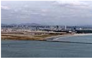
Naval Air Station

The north end of Coronado is occupied by North Island Naval Air Station , and the east is the headquarters for the Naval Amphibious Base.