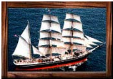
Star of India

On the waterfront is the San Diego Maritime Museum showcasing San Diego's rich maritime past. It consists of the century-old windjammer Star of India , the steam ferry Berkeley and the luxury yacht Medea .